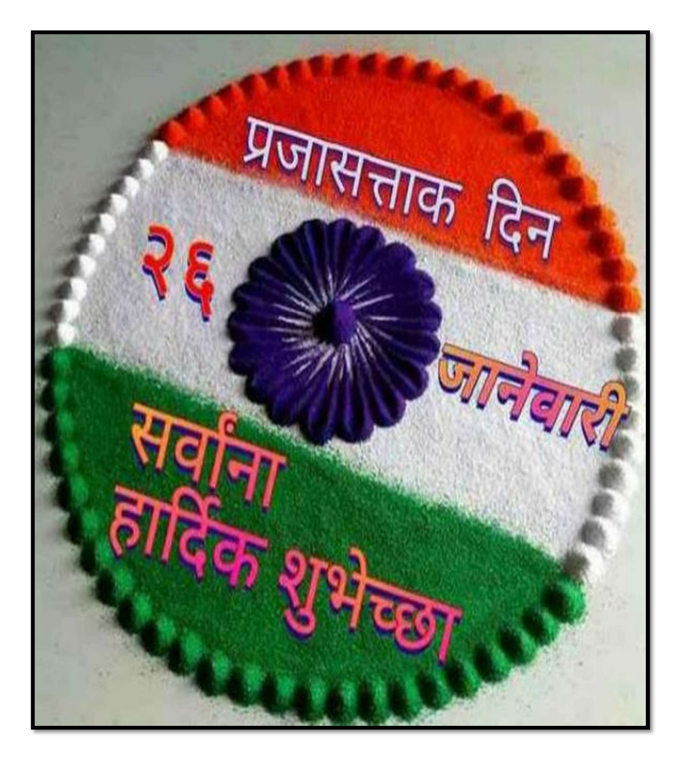
SNDT Arts and Commerce College for Women, Karve Road, Pune